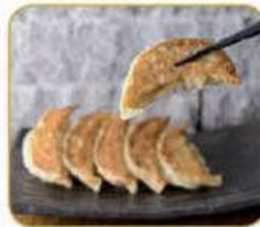
166. Chicken Gyoza ..... £5.00