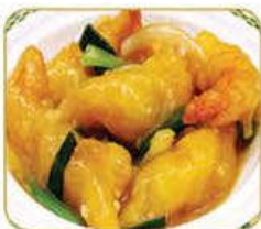
163. King Prawn with Butter 1 ..... £7.50