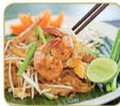
168. Thai Pad Tai Noodle 1 1 ..... £7.50