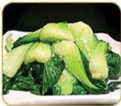
165. Stir Fried Pak Choi with Garlic 1 ..... £8.50