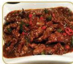
162. Stir Fried Beef with Black Pepper Sauce 1 ..... £7.00