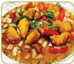
161. Chicken with Honey in Black Pepper Sauce 1 ..... £8.00