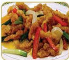
159. Seared Chicken 1 £8.00