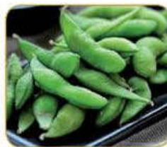
164. Edamame ..... £4.00