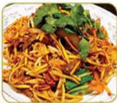
167. Thai Spicy Noodle 1 ..... £8.50