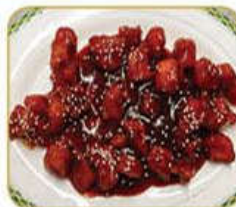
160. Hot Sesame Chicken 1 1 1 ..... £8.00